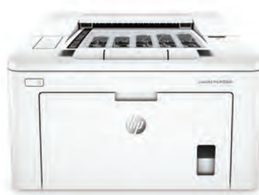
HP LaserJet Pro M203dn Printer

Get more pages, performance, and protection from a wireless HP LaserJet Pro powered by JetIntelligence Toner cartridges. Set a faster pace for your business: print two-sided documents right away, and easily manage to help maximise efficiency.