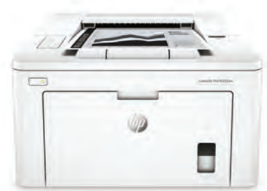
HP LaserJet Pro M203dw Printer